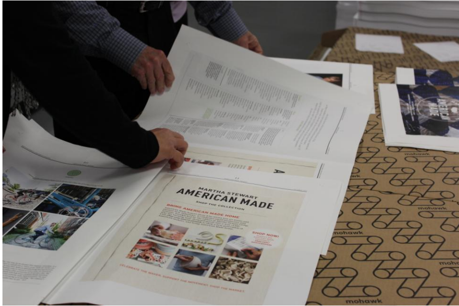
Inspecting the digital proofs of the Martha Stewart American Made Keepsake, printed on Mohawk Superfine, using the HP Indigo 10000 Digital Press at Sandy Alexander, in Clifton, NJ.