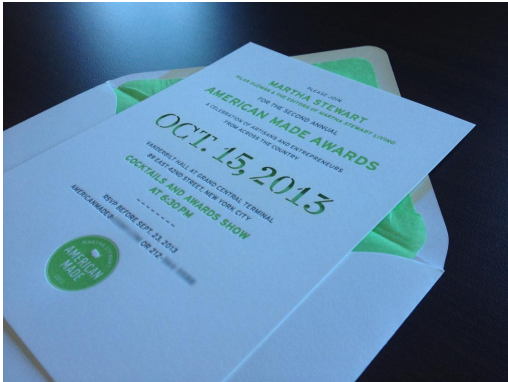
The invitation and matching envelope created for the 2013 Martha Stewart Living American Made red carpet awards ceremony - made with Cohoes-based Mohawk Superfine Eggshell Ultrawhite fine paper.